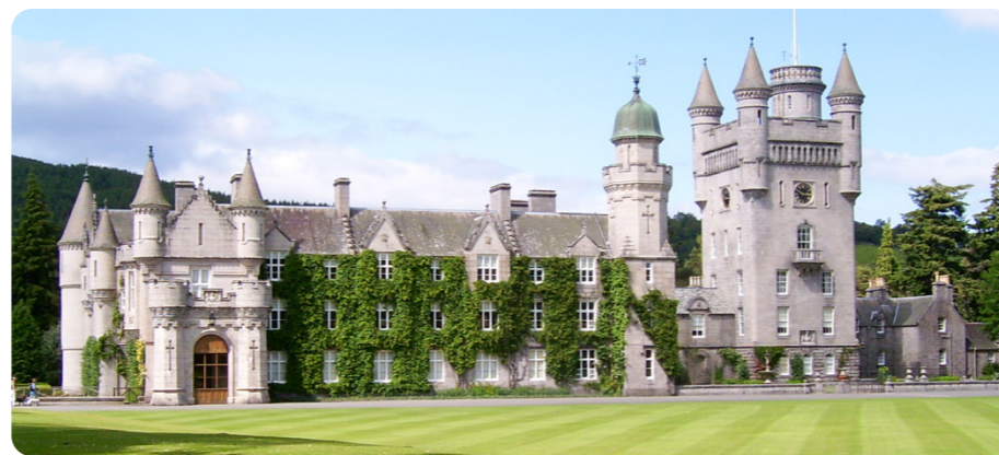
Balmoral Castle is in Aberdeenshire, Scotland.