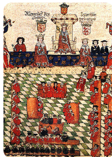
Edward I and the Model Parliament

The power of the monarchy has changed over time. In the past, some monarchs had absolute power. This meant that they could do whatever they wanted. Today, there is a constitutional monarchy. This means that the monarch is controlled by parliament and the government.