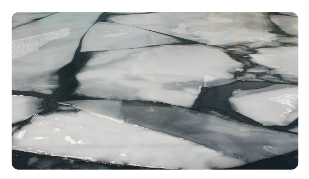
The weather can be very cold in winter and water in puddles and ponds can freeze into ice.