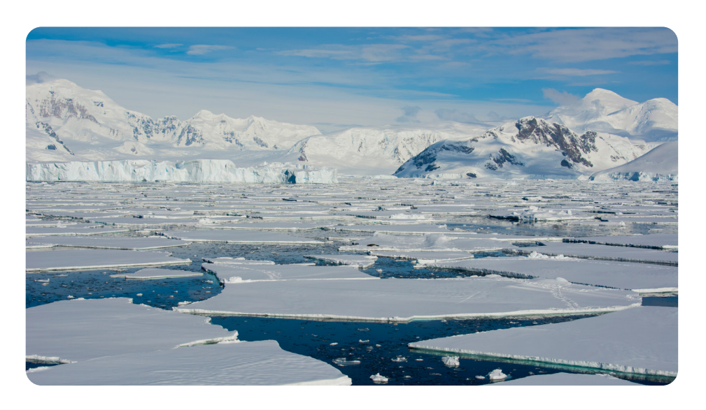
Some places are cold and snowy all year round like the Arctic and the Antarctic.