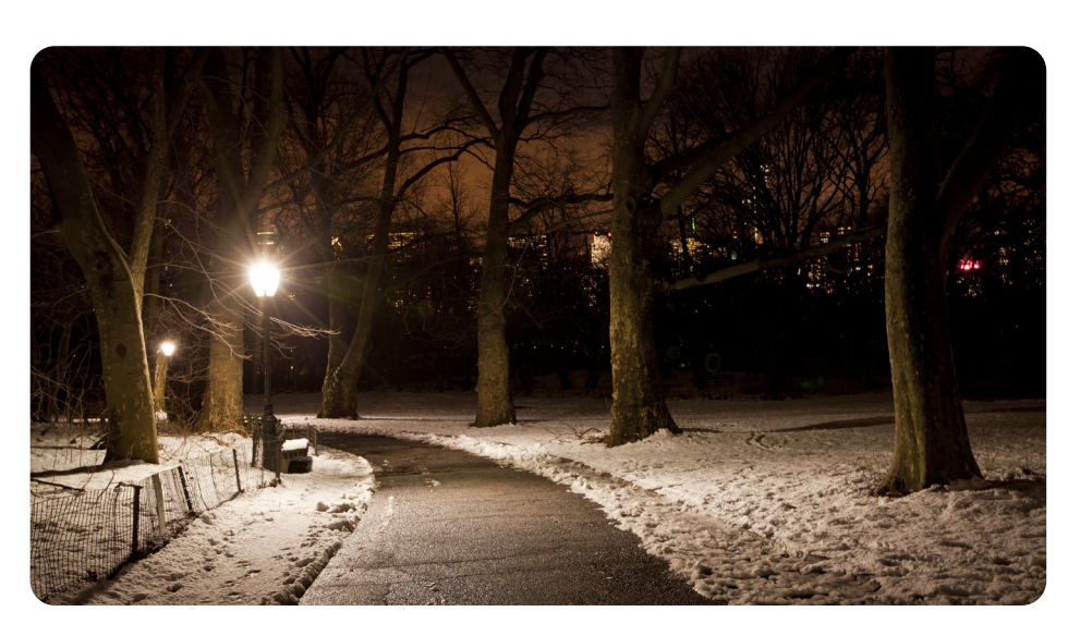
Winter is one of the seasons. In winter, the days are short and the nights are long.