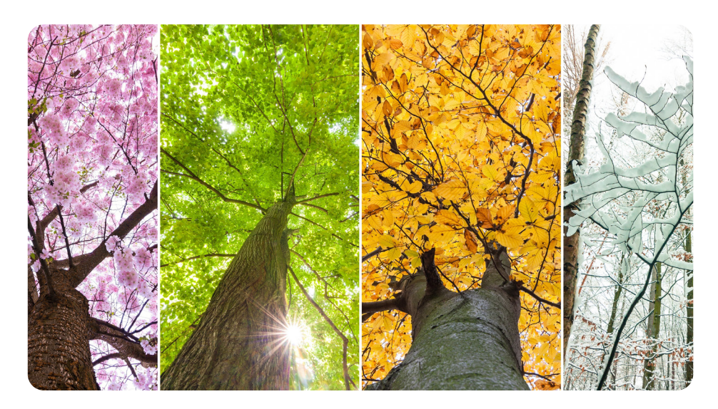
There are four seasons. They are spring, summer, autumn and winter.

Read these interesting facts about winter with a parent, carer or teacher.