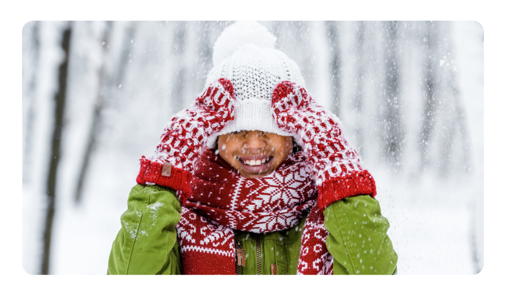
Sometimes it snows in winter.