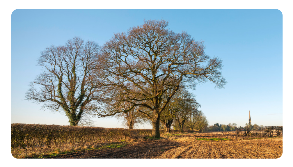
Lots of trees have no leaves in winter and not many plants can grow.