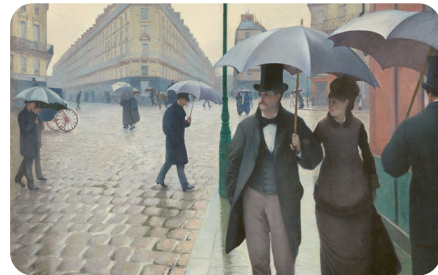
Paris Street; Rainy Day by Gustave Caillebotte, 1890