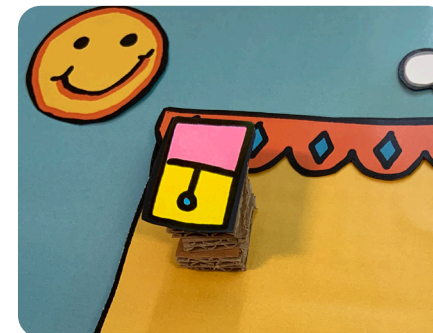
Five layers of cardboard make this window stand out.

Layers of corrugated cardboard can be glued to the back of cut outs to create a 3-D effect.