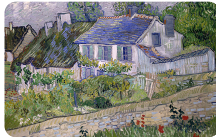
Houses at Auvers by Vincent van Gogh, 1890