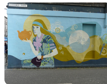
The Gifford Park mural by Kate George, 2015

A mural is a large picture that is usually painted onto a wall, ceiling or other structure.