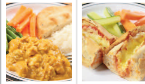
Chicken Korma served with Rice, Naan Bread & Seasonal Vegetable or Hot Pizza Baguette served with Carrot & Cucumber Sticks