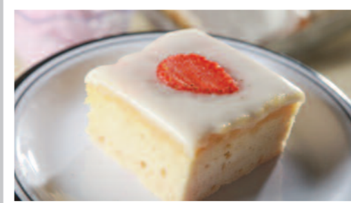
Strawberry Ice Cream Cake