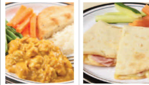
Chicken Korma served with Rice, Naan Bread & Seasonal Vegetable or Hot Cheese & Ham Wrap served with Carrot & Cucumber Sticks