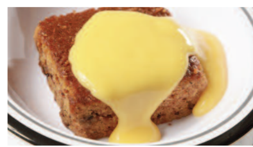
Sticky Toffee Pudding served with Custard