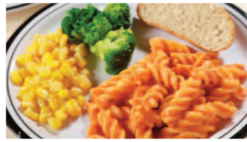
Tomato & Mascarpone Cheese Pasta served with Garlic & Herb Bread and Seasonal Vegetables