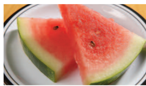
Fresh Water Melon Wedge