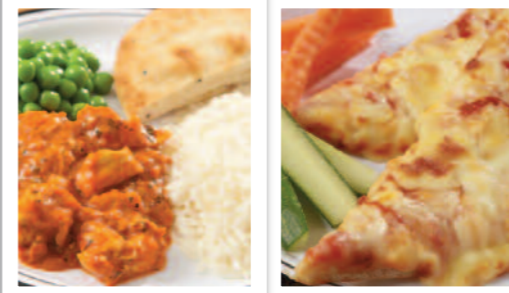
Chicken Tikka Masala served with Rice, Naan Bread & Seasonal Vegetables or Deep Pan Cheese & Tomato Pizza Slices served with Carrot & Cucumber Sticks