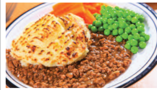
Cottage Pie served with Seasonal Vegetables