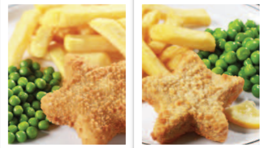
Salmon/Cod Fish Star (MSC) served with Chips & Peas or Baked Beans

VEGETARIAN VERSIONS OF THE ABOVE MEAL AVAILABLE DAILY