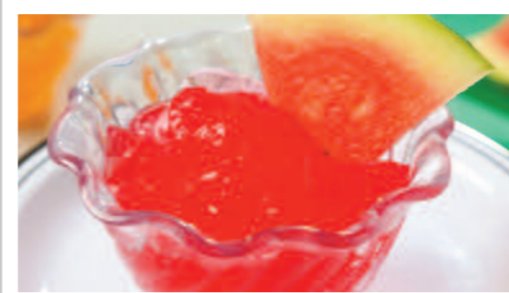
Jelly & Fruit