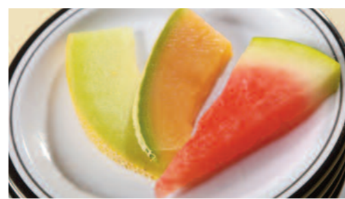
Trio of Melon