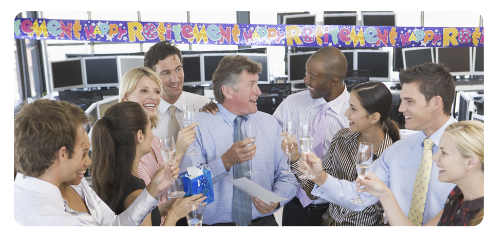
Retirement happens when an elderly person leaves work.