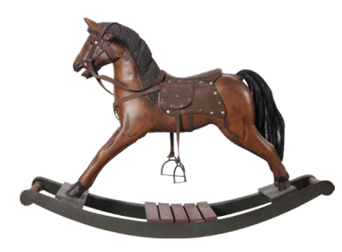
wooden rocking horse