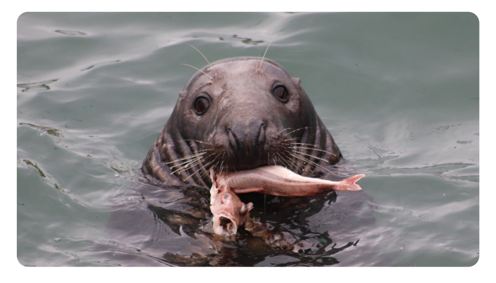
Carnivores eat other animals. Herbivores eat plants. Omnivores eat plants and other animals.