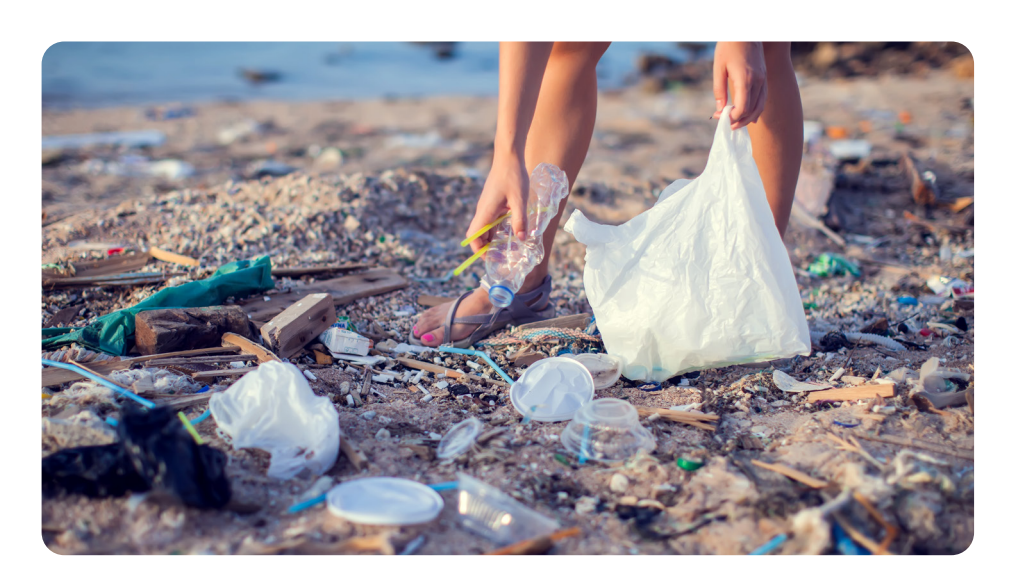
Leaving litter on beaches can harm and even kill the animals that live in the sea or on the seashore.