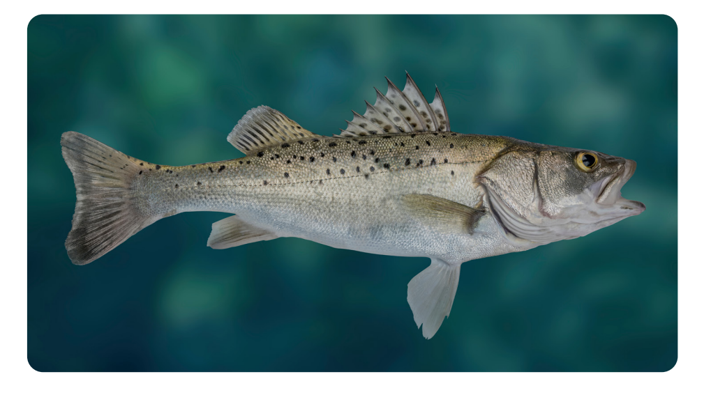
Fish use gills to breathe. They use their tails to swim and have fins to keep them upright.