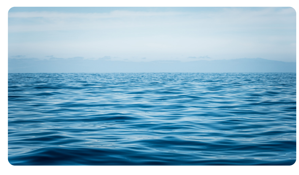
The ocean is a body of salt water that covers over two thirds of the surface of the Earth. The largest ocean is the Pacific Ocean.