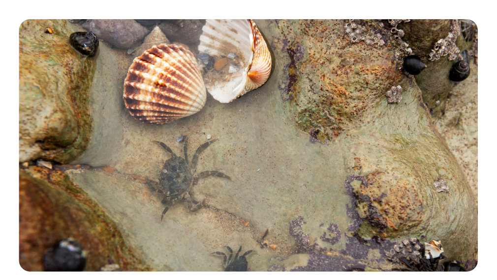
Rock pools are shallow pools of seawater on the rocky part of the seashore. Some only appear at low tide. They are habitats for many animals, such as starfish and crabs.