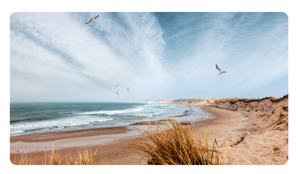
The seashore is the land along the sea or ocean. A beach is an area of sandy, pebbly or rocky land that is usually by the sea.

Read these interesting facts about the beach with a parent, carer or teacher.