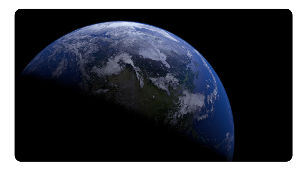
We live on a planet called Earth. It gets dark at night because our part of Earth is facing away from the Sun.