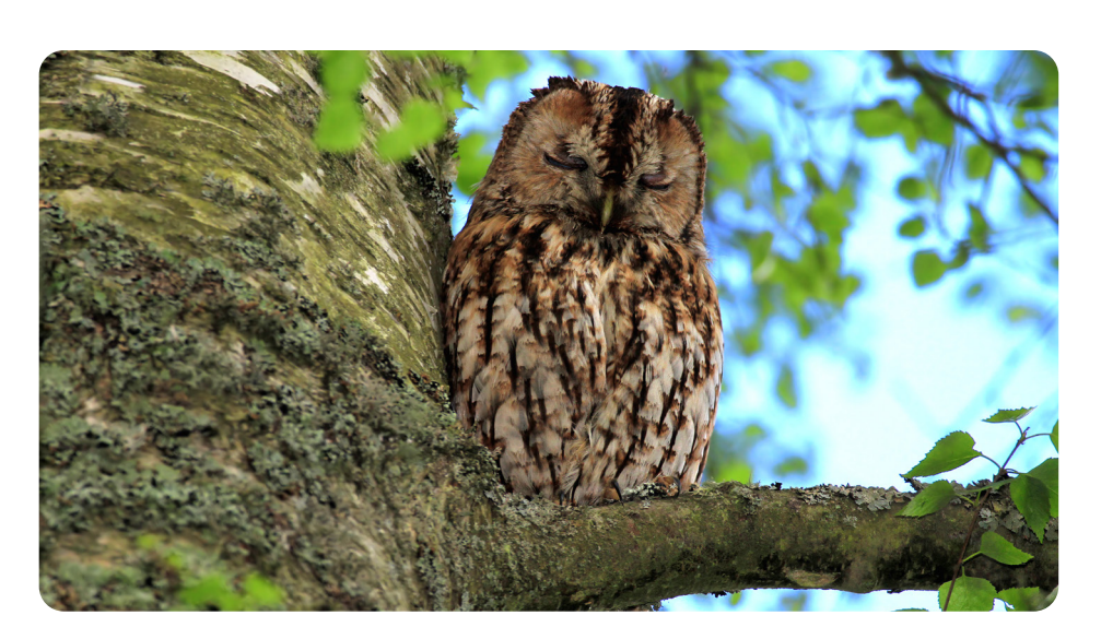
Some animals sleep in the day and are awake at night. They are known as nocturnal animals.