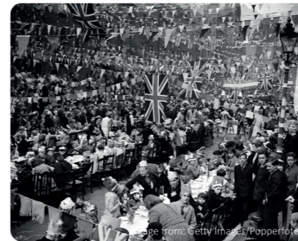
Street party to celebrate the coronation.