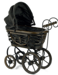
wood and metal pram