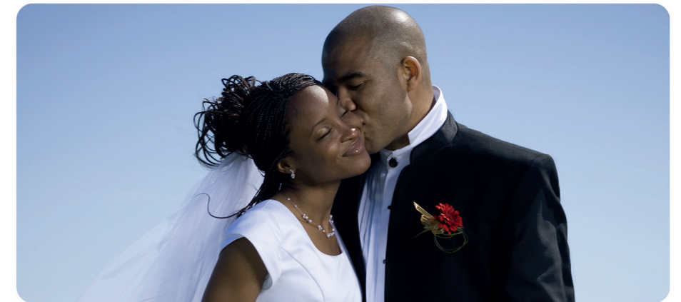
Weddings happen when two adults get married.