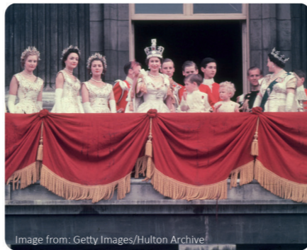
Queen Elizabeth II on her coronation.

A coronation is a ceremony where the crown is placed on the head of the new king or queen. Elizabeth II was the Queen of the United Kingdom for 70 years until she died in 2022. The coronation ceremony of Elizabeth II took place on 2nd June 1953 at Westminster Abbey, London. Many people celebrated the coronation by holding street parties.