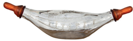
Victorian baby bottle

An artefact is an object from the past. Museums often display historical artefacts. Artefacts can tell us about how people used to live. Everyday objects like baby bottles, clothing, toys and books can tell us about childhood in the past.