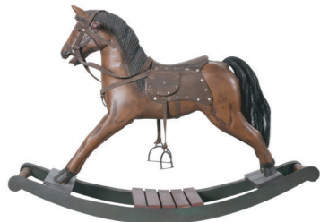
wooden rocking horse