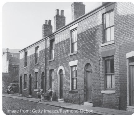
A street in the 1950s.

The way people use land changes over time. For example, in the 1950s there were fewer cars, so fewer roads were needed. Today lots of people have cars, so there are many more roads for people to drive on and driveways for parking.