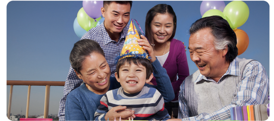
Birthdays happen every year.

Important life events include birthdays, religious festivals or family celebrations. Some life events happen every year and some happen at certain stages of human life.