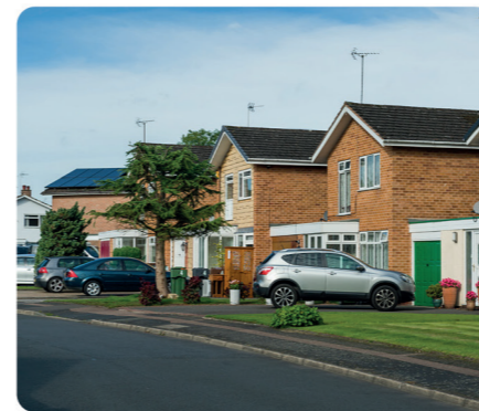
A street today.