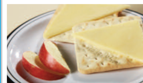
Cheese & Crackers