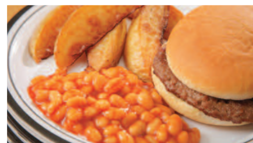
Beef Burger served in a Bun with Potato Wedges & Seasonal Vegetables or Baked Beans