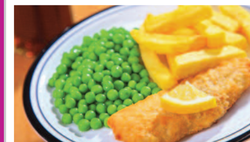
Battered Fish (MSC) served with Chips & Peas or Baked Beans

VEGETARIAN VERSIONS OF THE ABOVE MEAL AVAILABLE DAILY