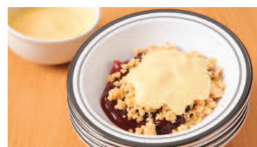
Fruit Crumble & Custard