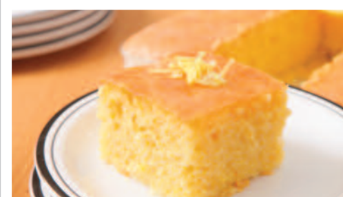
Lemon Drizzle Cake