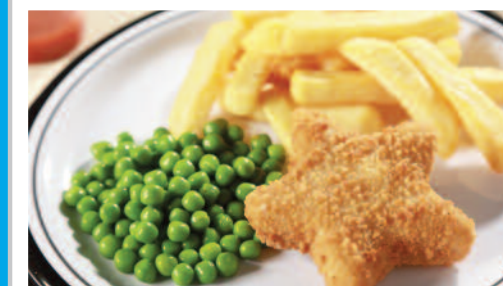
Fish Star (MSC) served with Chips & Peas or Baked Beans

VEGETARIAN VERSIONS OF THE ABOVE MEAL AVAILABLE DAILY