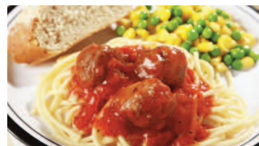
Meatballs in Tomato Sauce served with Spaghetti, Garlic & Herb Bread and Seasonal Vegetables