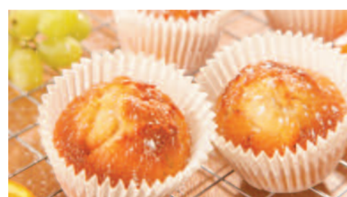
Apple & Cinnamon Muffin