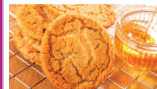
Golden Crunch Cookie

AVAILABLE EVERY DAY – UNLIMITED SALAD, FRESHLY BAKED BREAD, FRUIT YOGHURT & FRESH FRUIT PLATTER. FOR ALLERGEN INFORMATION, PLEASE ASK ONE OF OUR CATERING TEAM. ALL THE ABOVE DISHES ARE SUBJECT TO AVAILABILITY.