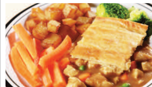
Homemade Chicken Pie served with Diced Crispy Potatoes & Seasonal Vegetables