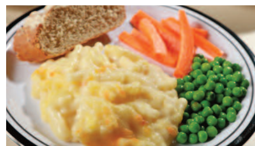
Mac 'n' Cheese served with Garlic & Herb Bread and Seasonal Vegetables