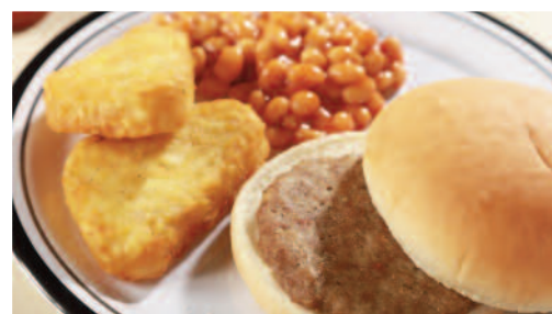
Sausage Pattie in a Bun, Hash Browns and Baked Beans