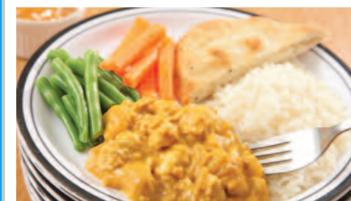
Chicken Korma served with Rice, Naan Bread & Seasonal Vegetables