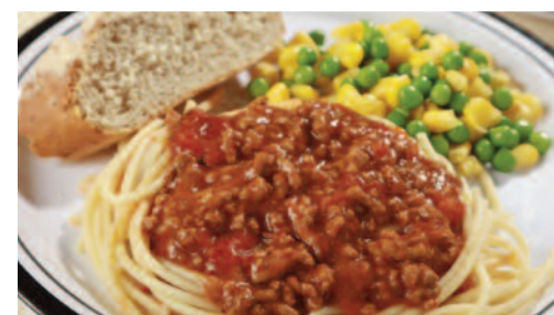
Spaghetti Bolognese served with Garlic & Herb Bread and Seasonal Vegetables